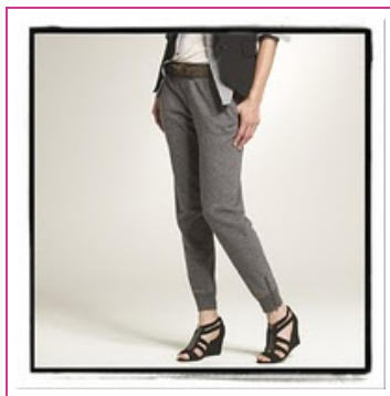
J. Crew Woolcot Pant, $65

Fleece as fashion. Oui ou non? I love the shape of these pants, and can't help but be tempted by their coziness as the nights get cooler. But, I ask you, dear friends, are they too representative of an 80's revival gone wrong? They wouldn't just be worn around the house; I would pair them with slouchy boots, a silky tank and an oversized belted sweater. What about you? How would you wear the Woolcot pant?